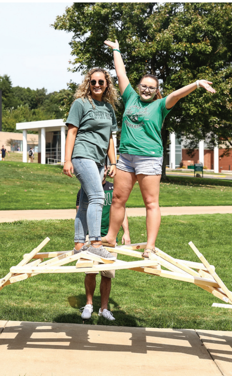
Locations of LLCs may be subject to change.

Most residence halls that house an LLC have a meeting room with resources just for the LLC students.