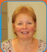
Counseling Center Staff