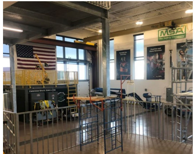
Photo 3: New High-lab laboratory with state-of-the-art industrial simulators

industrial simulators. These simulators include applications that before were only read about by students in textbooks. The Safety Management students now use and experience real-world equipment and their application before they enter the workforce. The equipment used by the students is a direct result of several key partnerships with premiere industrial leaders and suppliers. Some of these partnerships include companies like: MSA, New Pig Inc., Firefighter Sales and Service, Rockford Systems, Kokosing Inc. TSI Inc., and SKC Inc. The program also receives tremendous support from past alumni and faculty who have either donated equipment or contributed to the program financially.